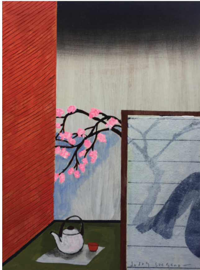
Tea for one Dodog Soeseno acrylic paint, collage, on gouged board 25 x 32 cm 2018