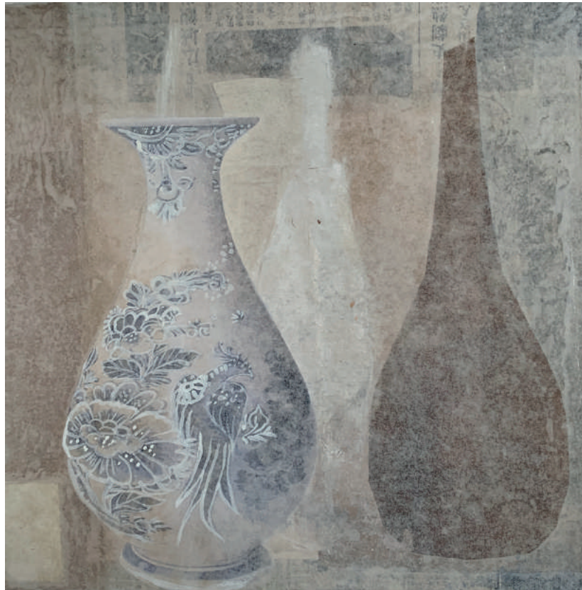
Blue memories 25 I Paula Kouwenhoven acryl and shoji paper on canvas 30 x 30 cm 2019