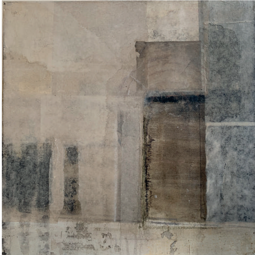
Blue memories 238 Paula Kouwenhoven acryl and shoji paper on canvas 40 x 40 cm 2019