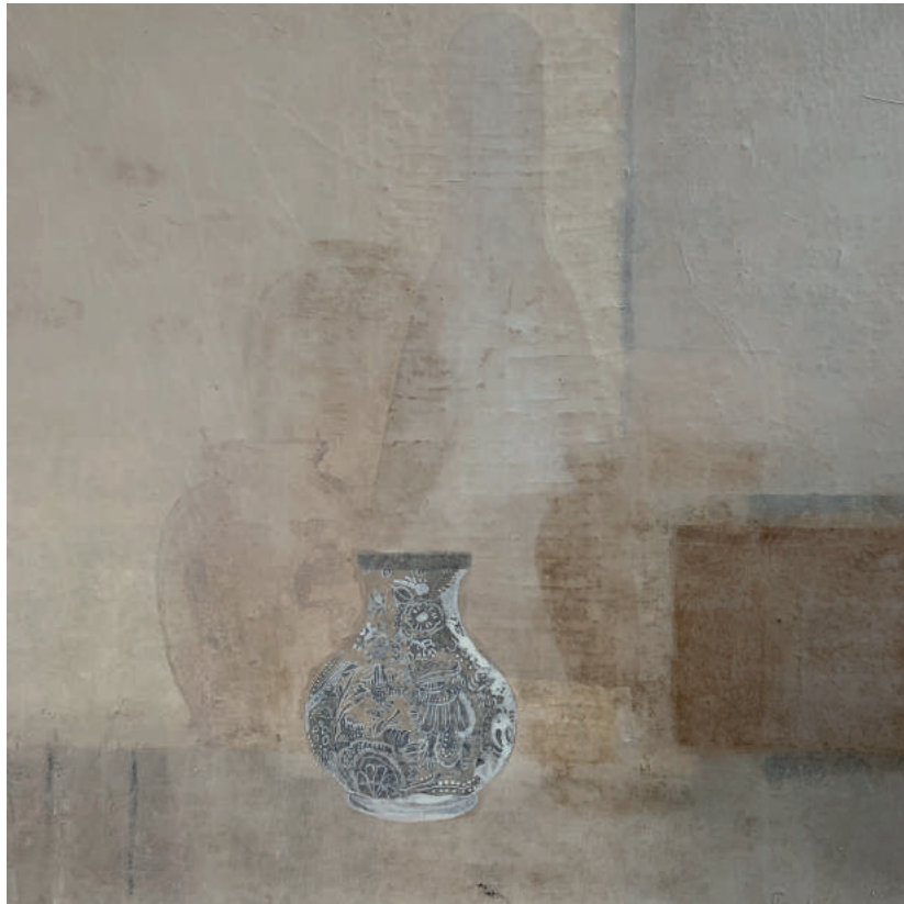
Blue memories 229 Paula Kouwenhoven acryl and shoji paper on canvas 70 x 70 cm 2019