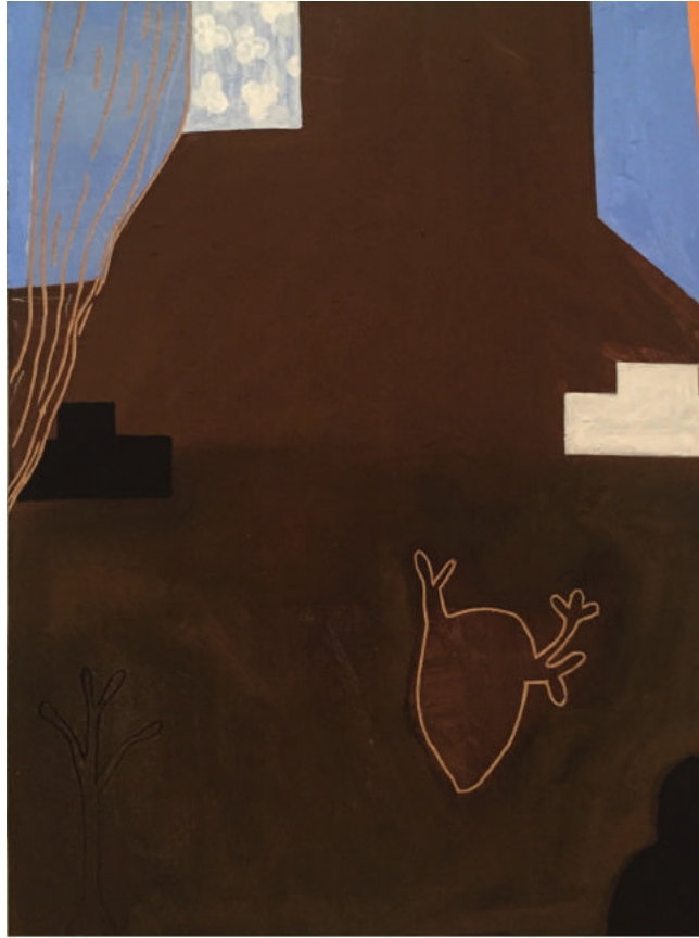
NT - 02 Dodog Soeseno acrylic paint on gouged board 25 x 32 cm 2018