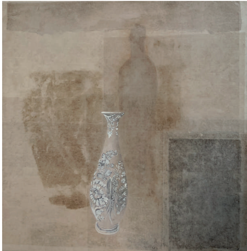
Blue memories 241 Paula Kouwenhoven acryl and shoji paper on canvas 40 x 40 cm 2019