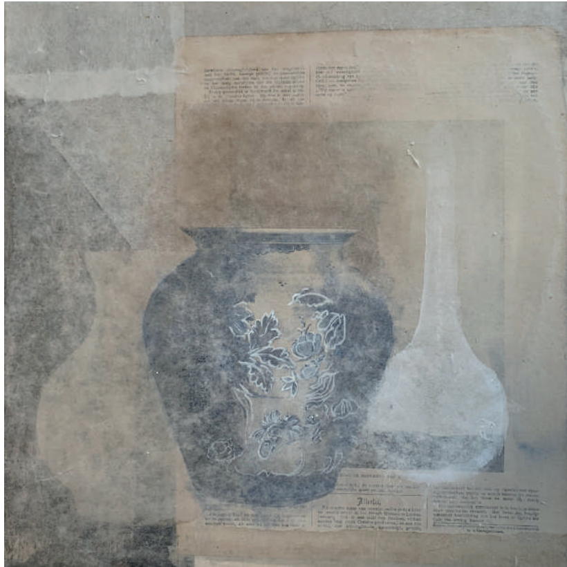
Blue memories 248 Paula Kouwenhoven acryl and shoji paper on canvas 40 x 40 cm 2019