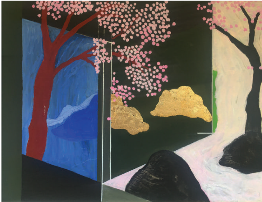
Story on postcard No:01 Dodog Soeseno acrylic paint, gold leaf - on canvas 30 x 40 cm 2019