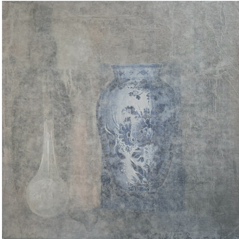
Blue memories 228 Paula Kouwenhoven acryl and shoji paper on canvas 40 x 40 cm 2019