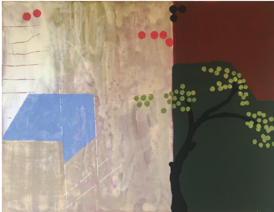
Story on postcard No:08 Dodog Soeseno acrylic paint on canvas 30 x 40 cm 2019